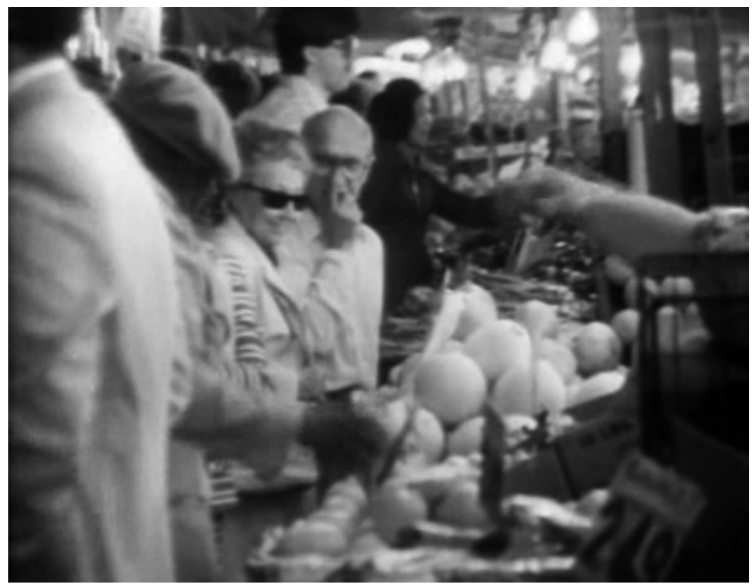
Street markets from episode 1 of Free to Choose