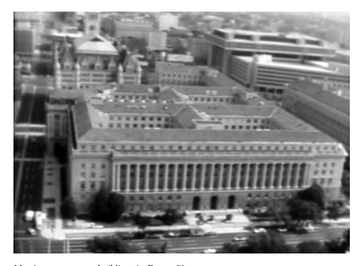
Massive government buildings in \mathit{Free}\ \mathit{to}\ \mathit{Choose}